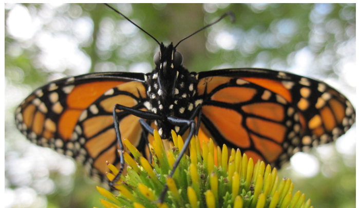
A Monarch Butterfly

The Region is currently undergoing changes to our woods, fields, wetlands, and waters due to invasive species. Invasive species are non-native species (both plant and animal) that flourish to the detriment of native species. 3 They occur in lakes and rivers, as with Eurasian milfoil or the algae didymo (“rock snot”); in wetlands, as with species such as purple loosestrife; fields, as with wild parsnip or buckthorn; and in forests, as with the emerald ash borer. Invasives are best managed by avoiding infestations through management actions that limit spread, such as the ban on moving untreated firewood across state lines. Some species can be managed through well-timed mowing or manual removal. A well-educated citizenry is one of the best defenses against inadvertent spread. Once established, invasives are very difficult to control. As climates shift northward, species that had been kept at bay due to extreme cold will be on the rise.