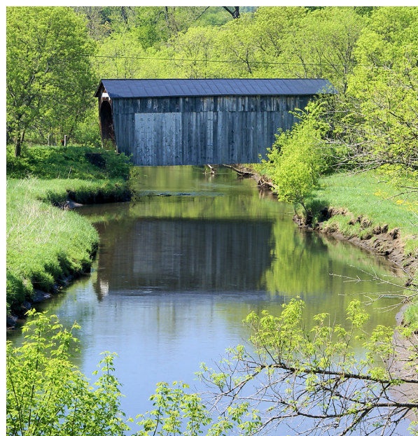
Kingsbury Bridge, Randolph

The Connecticut River forms the eastern boundary of Vermont, and the entirety of the TRO Region lies within its watershed. The Connecticut River shoreline forms the border of the towns of Hartland, Hartford, Norwich, Thetford, Fairlee, Bradford, and Newbury. There are large sections of the shoreline area that have exhibited erosion. The Connecticut River features a major hydroelectric facility, the Wilder Dam, which is operated by Great River Hydro (formerly owned by TransCanada). The Wilder Dam's impoundment, or reservoir area, extends for 45 miles upstream to the Town of Newbury. The reservoir fluctuates daily as the owner of the facility increases the rate of water to the turbines to generate electricity during peak periods. However, the daily fluctuation, which can be up to five feet, can dramatically affect the shoreline areas of the Connecticut River. The rapid saturation and removal of water along streambank areas has caused erosion and the flooding of large areas along the Connecticut River, which impacts waterfowl nesting, fish habitat, transportation infrastructure, and private properties.