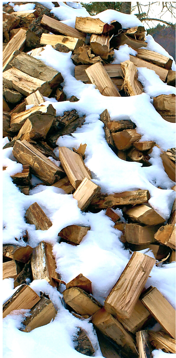
Snow Covered Firewood

As climate change and potential regulations to curb its impact grow in importance to national policy makers, business leaders are considering forest growth as an inexpensive way to mitigate atmospheric carbon. Forest managers may be able to receive financial benefit from the value of carbon storage, in effect selling another product off their land, and thus increasing the economic viability of sustainable forest management in the Northeast.