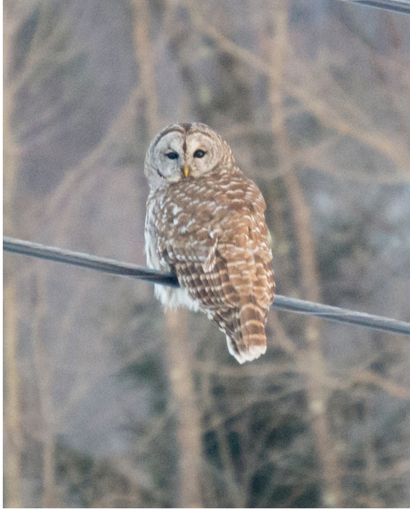
Barred Owl at King Farm

have been declining in number in recent years. Rivers in the Region also provide important habitat for waterfowl such as snow geese and several varieties of ducks as well as herons and rails. Some sections of rapidly moving water in Bridgewater have been used by bald eagles during migration, and great blue heron rookeries are located in Hartland and Tunbridge.