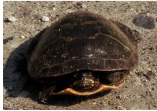
Turtles—Integral Species in the Region's Ecosystem | © K. Kanz, 2002